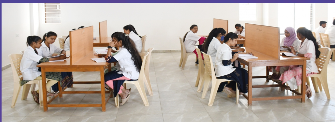
Library has a huge collection of books, journals and CDs. The cyber center helps students with E-learning.