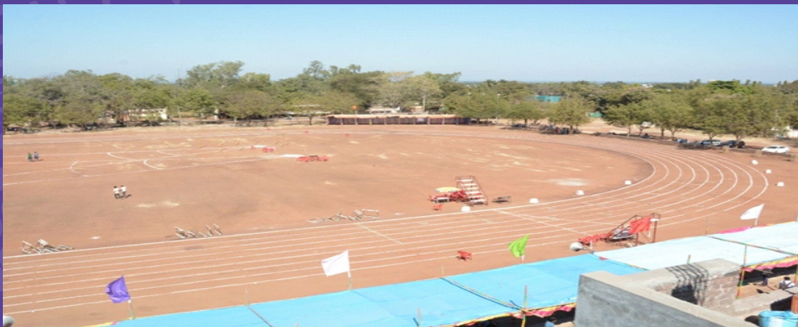
BLDEA's Polo Ground