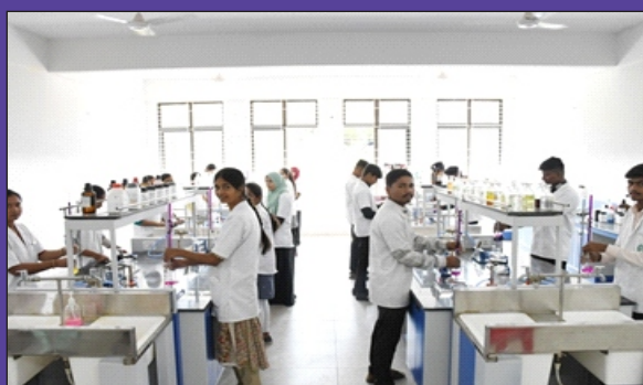
Pharmaceutical chemistry Laboratory